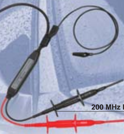
701922 200 MHz Differential Probe