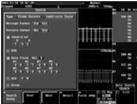
Data Search Setup Menu