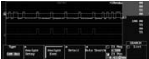
Stuff Bit Display