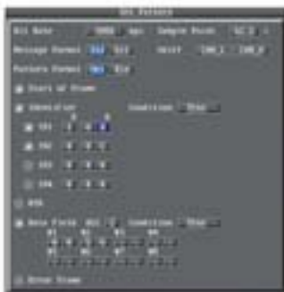
Trigger Conditions Setup Menu

Use up to 32 megawords of memory (DL1640L) to acquire long strings of CAN bus waveform data and then analyze the data in a time-series manner. Analysis results are then listed along with the waveform. Results include: ID and Data fields, ACK field status and other information. The frame which is highlighted by the cursor on the analysis results list automatically appears in the zoom window. This feature enables you to observe the bus signal while concurrently viewing the analysis results. Thus, you can easily verify how noise or level fluctuations affect the communication data and carry out debugging work very efficiently.